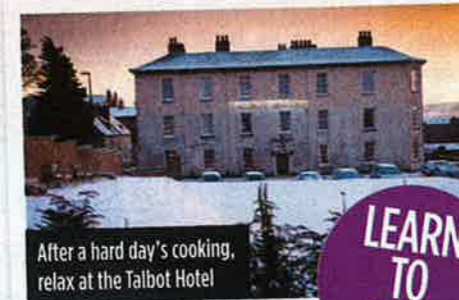
After a hard day's cooking, relax at the Talbot Hotel

* BOOK IT: Christmas Wrapped Up is available on the 3, 4 and 6 December and costs from £395 for two people including dinner, B&B (01653 639096/fihotels.com).