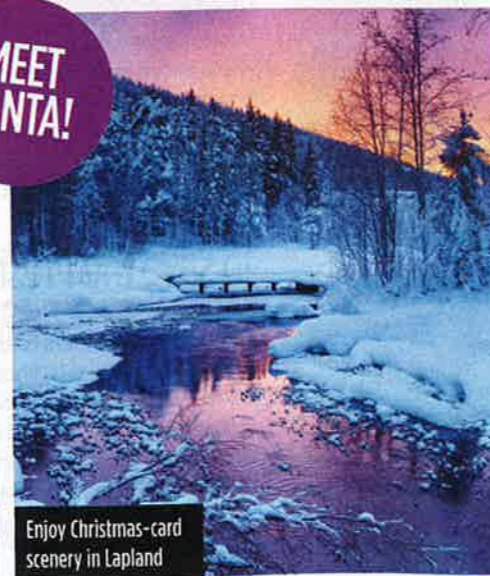
Enjoy Christmas-card scenery in Lapland