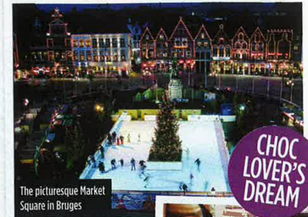
The picturesque Market Square in Bruges