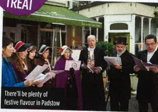
There'll be plenty of festive flavour in Padstow

* BOOK IT: Stay at the chic St Petroc's Hotel (01841 532700/rickstein.com) in the heart of town from £160 per night for a double room with breakfast.